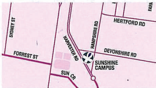
Sunshine Campus 122 Harvester Road Sunshine