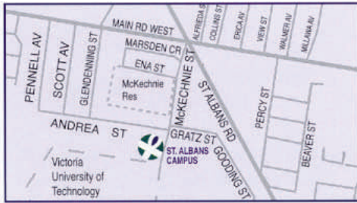
St Albans Campus 1 Andrea Street St Albans